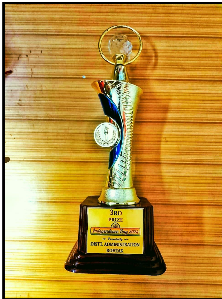
INDEPENDENCE DAY PARADE