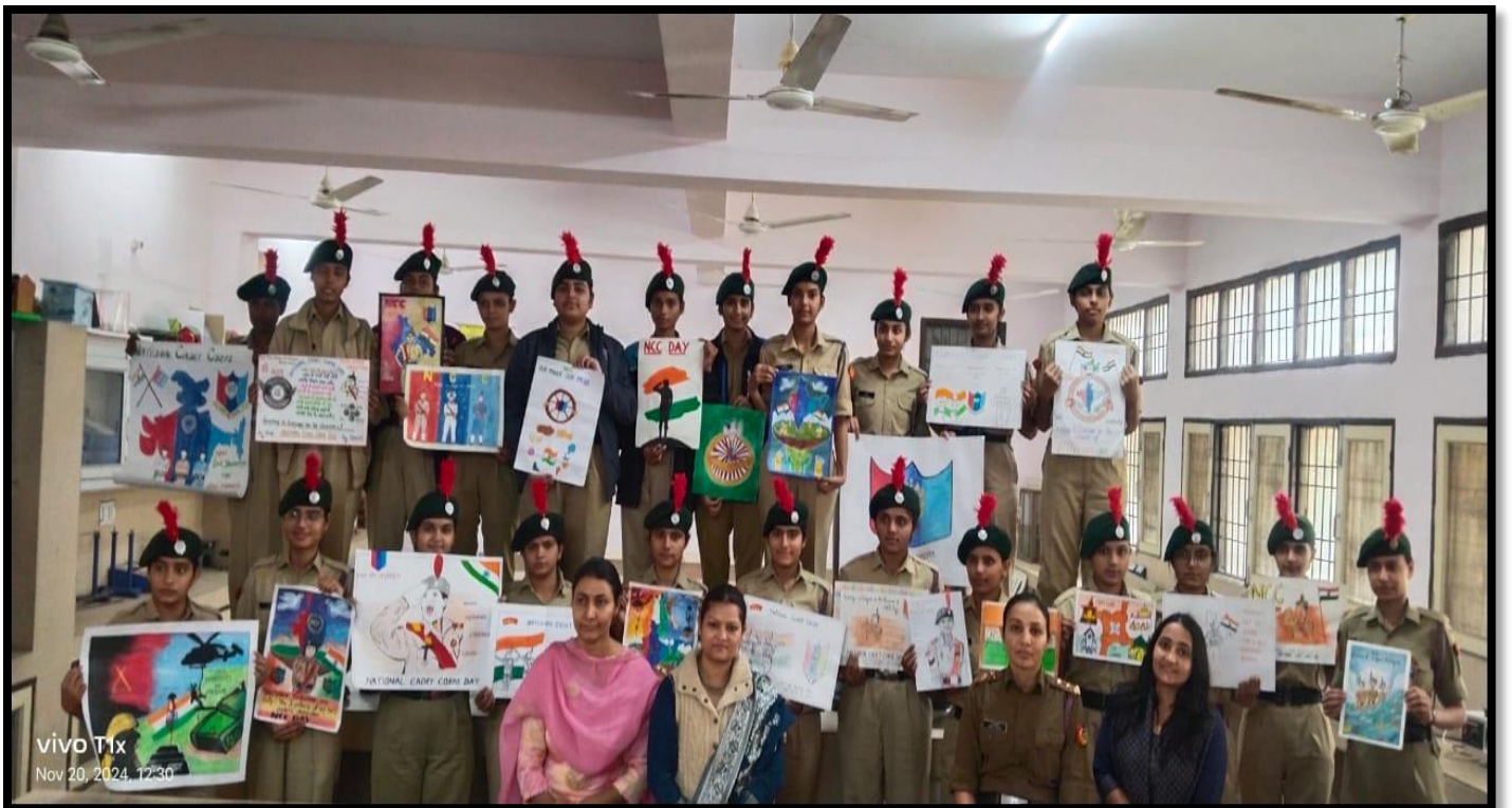
NCC DAY CELEBRATION