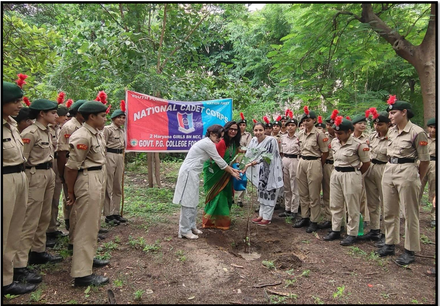
ANTI DRUG DAY CELEBRATION