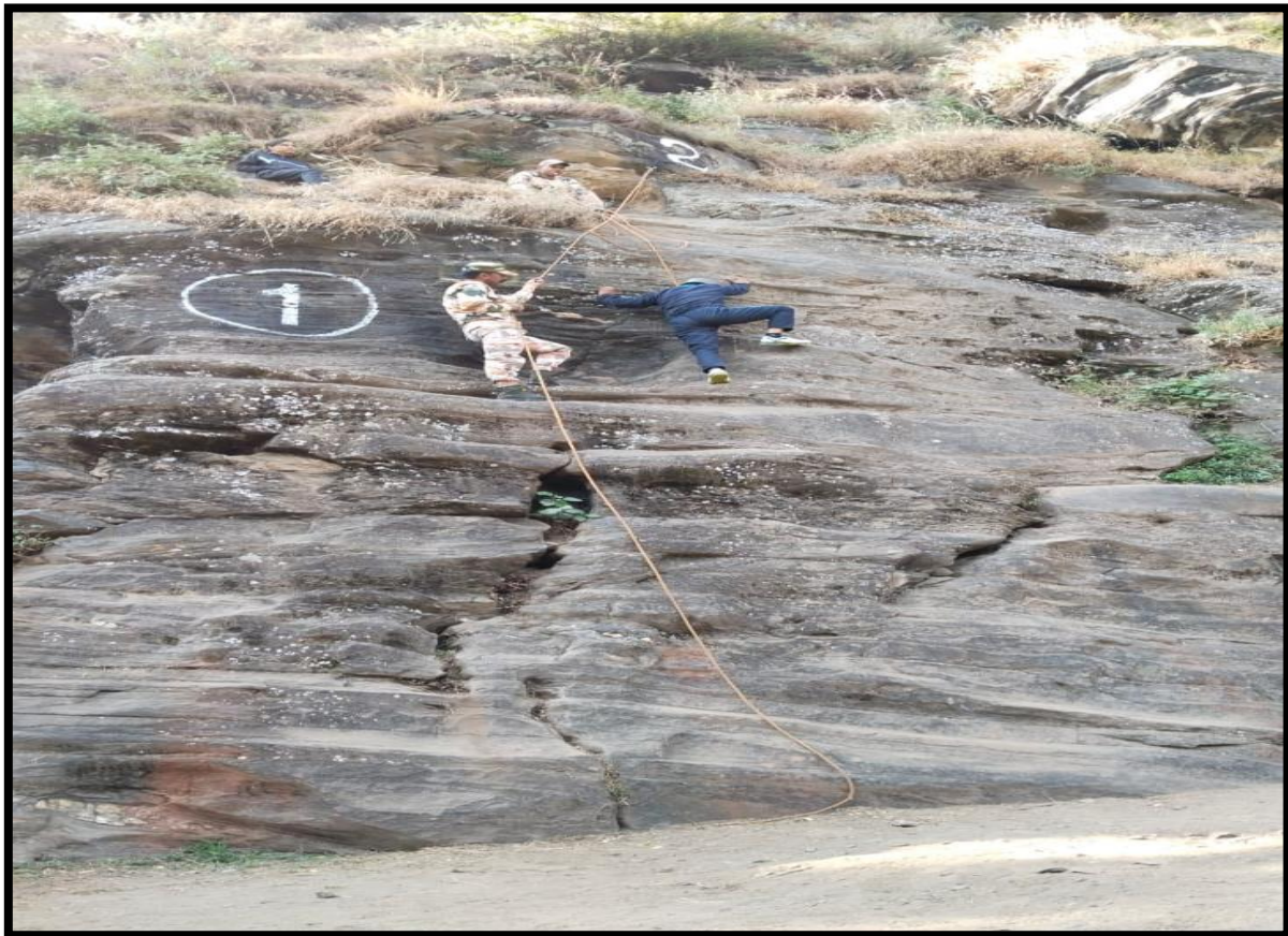
ROCK CLIMBING CAMP